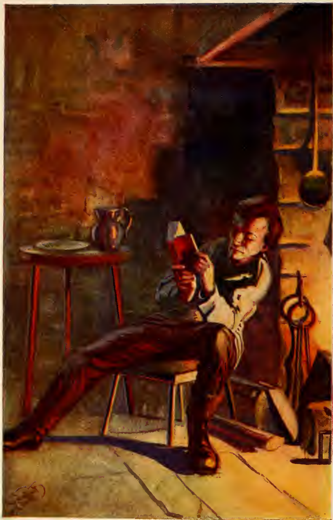
THE BOY LINCOLN READING BY THE LIGHT OF THE FIRE

(After a painting by Eastman Johnson made in 1868)